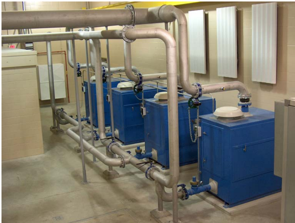
Four ThermAer ATAD blowers, 3 duty blowers with 1 stand-by

When the tanks are being fed, the operating temperature of the tank begins to drop. Once the feed cycle ends and react mode begins, the temperature begins to rise as the thermophilic process destroys the solids. Air is continuously added to the process by 30 HP (25 KW) positive displacement blowers through a jet aeration header system. The blowers are variable frequency drive (VFD) driven and ramp up or down during treatment based on the ORP (oxidation reduction potential) in the reactor. This assists in the efficiency of the system, but also has another important role - the ability to vary the liquid flow and the air flow independently also aids in controlling the operating temperature of the reactor. This has been shown to be a cost effective operating method while still providing optimum digestion and metabolic conversion.