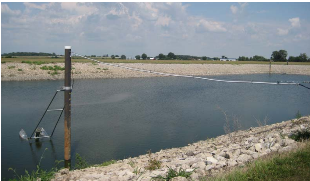
Franklin Storm Lagoon – Increased from 4 to 10 million gallons in 2006

The City also has two interceptor sewers that capture and convey flows in excess of the existing collection system. The Franklin Street Interceptor Sewer has a capacity of 400,000 gallons (1,500 m 3 ) and conveys storm flows to the Franklin Street Storm Pond pump station that sends the flows directly to the Franklin Street storm pond. The Jennings Creek Interceptor Sewer has a capacity of 323,000 (1,220 m 3 ) gallons and conveys water to the North Street pump station that pumps the storm water to the Jefferson Street storm pond. There is also an equalization line between the two ponds that allows the flows to equalize to either of the two ponds when open. The storm water from these ponds is returned to the influent pump station wet well once the flows at the treatment plant have decreased enough to begin to receive the storm water. The storm water then receives full treatment at the plant. If the wet weather event continues and the treatment facility is treating 12 MGD (45,000 m 3 /day) and the ponds become full, the system will bypass from one of the seven approved points in the collection system. The entire system, according to our approved Long Term Control Plan (LTCP) is designed to reduce those bypasses to less than four events in a typical year.