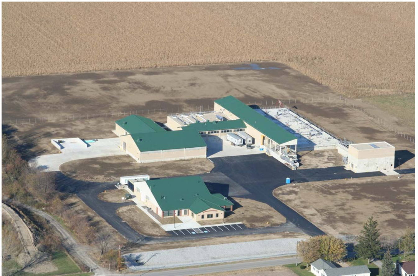
City of Delphos MBR / ThermAer ATAD Wastewater Treatment Facility

Using the concept of biohydraulics , the MBR System was designed to exceed biological treatment objectives over the range of expected operating conditions. Designed using the Storm Master™ configuration, the plant is also equipped with the Symbio® technology, which helps to promote simultaneous nitrification and denitrification (SNdN) in the supplemental aeration zone. Operating at low DO in SNdN mode can reduce operating costs and ensure optimum biological process performance. The Storm Master™ design is an important feature of the Delphos WWTP because it further reduces overall plant operating costs by putting offline membrane capacity to beneficial use. Utilizing the Storm Master™ design, Enviroquip and the City's engineers actually automated the plant to handle flows ranging from 300 gpm or 0.019 m 3 /sec (0.4 MGD / 1,500 m 3 /day) to a maximum net capacity of 8,328 gpm or 0.53 m 3 /sec (12.0 MGD / 45,425 m 3 /day). As a result, the effective turndown ratio of the plant is 28:1. The plant has already experienced minimum recorded flows of approximately 400 gpm (0.025 m 3 /sec) and peak flows in excess of 8,000 gpm (0.50 m 3 /sec) during periods of high rainfall.