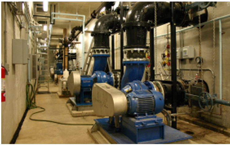
Bowling Green Pump Gallery

Experience from earlier design and the local operating conditions at Bowling Green have resulted in several important design innovations. First, primary, screened septage and waste activated sludge flow to one of two ATAD reactors. The reactors, fed on alternate days, allow continuous sludge feeding and 24-hour isolation for pathogen kill. This innovation eliminated the need for a raw sludge storage tank, reducing construction costs. Second, the digested biosolids are transferred to a storage tank and cooled from 145°F to 95°F prior to their introduction to the Storage Nitrification/Denitrification Reactor (SNDRTM). This part of the process reduces the ammonia from the ATAD reactors, improves settling and dewatering and controls biosolids' pH between 6.5 and 7.2. Third, treated biosolids are then transferred to storage tanks equipped with jet aeration, to produce a flocculent biomass that is very stable prior to centrifuge dewatering. Fourth, the nitrification tank acts as a prescrubber for the odor control system, removing ~60% of the ammonia found in the ATAD reactors before the BiofiltAer™, which reduces the overall biofilter size. These innovations reduce operating costs and produce quality biosolid material which is more valuable as a soil amendment, extremely stable and virtually odor-free.