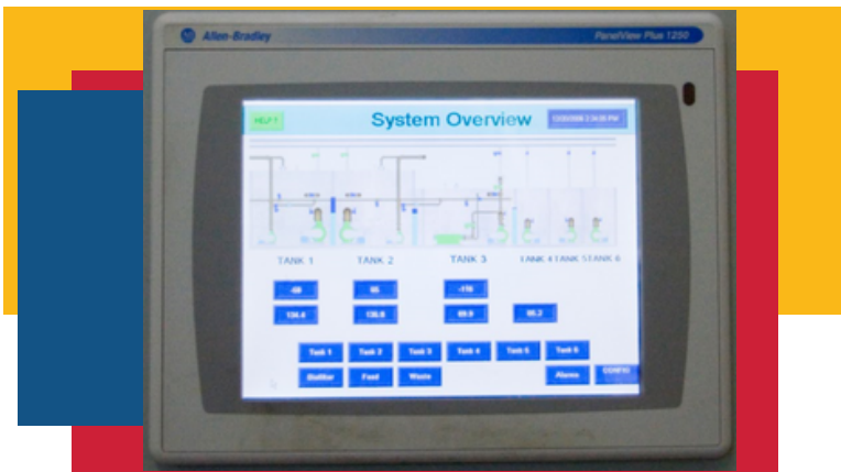
A ThermAer Control Panel Display

Jet aeration in conjunction with ORP set points provide for independent control of the aeration and mixing intensity as well as optimization of the process reaction rate. The control panel is operator friendly and has the ability to conduct interactive training on the fly with recommendations for performance enhancements. The pasteurized biosolids are cooled and nitrified in a separate reactor to provide additional stability prior to land application.